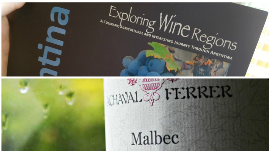
Exploring Wine Regions: Argentina with Achaval-Ferrer 2013 Malbec

I was recently asked what I do to deal with writer's block. My answer to that: read! Read books by writers with compelling voices, books set in inspiring places, books that illuminate the mind. Here is a selection of books that are designed for wine and food lovers. These are the sort of books that I open when I want to learn, feel hungry and get excited. Books about wine have been a must in my writing life, key to the secrets of the vineyard and the cellar.