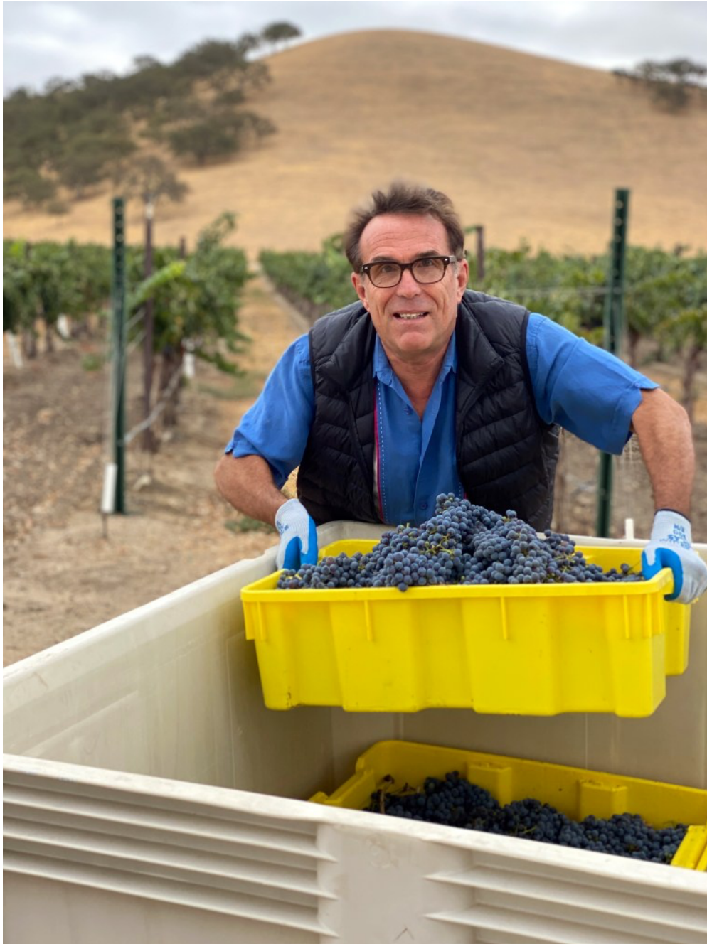
From 'The Central Coast of California: Discovering Great Wines, Phenomenal Foods and Amazing Tourism' by Michael Higgins