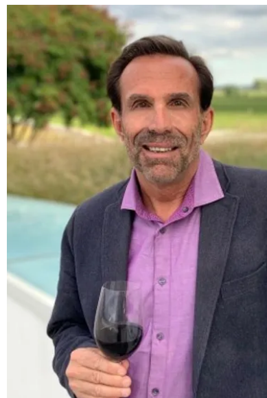
Exploring Wine Regions - California Central Coast

https://www.exploringwineregions.com/product/exploring-wine-regions-california-central-coast/ .